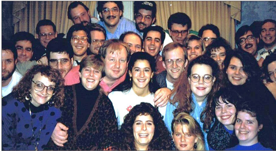
An Early AMUN staff photo.