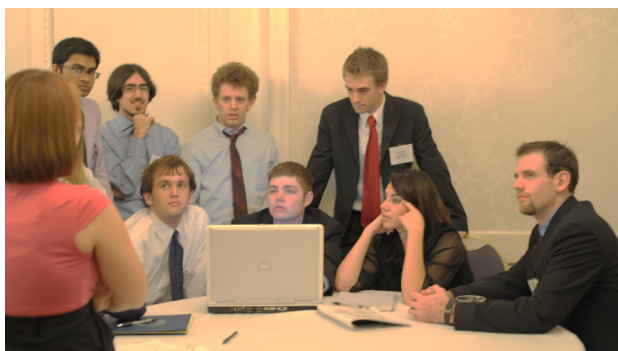
Representatives of Member States of the Security Council in caucus drafting Resolution SC/4.