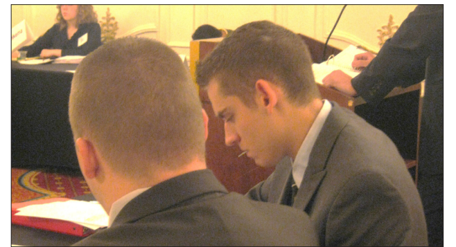
Intense deliberations in the ICJ.

cate for Colombia strongly refused the facts and states that in 1913, Nicaragua for the first time laid the claim to certain islands in the San Andres Archipelago, after lengthy negotiations, the Treaty of 1928 along with